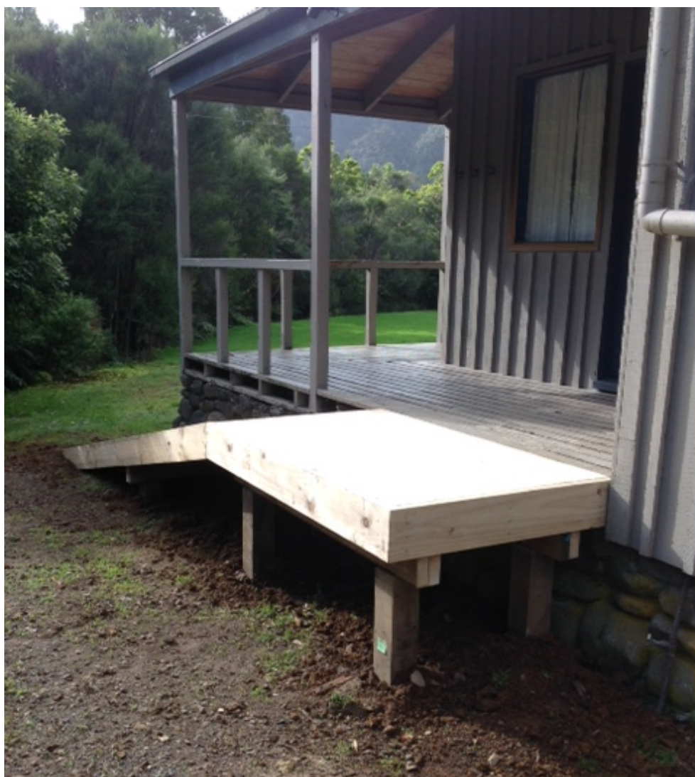
Ross McCarthy replaced the original ramp in 2015 for safer access.

During 2017, the Lodge continued to provide an activity base for a number of Brigade and other users but was inaccessible for months after catastrophic flooding closed the road. It is advertised on the Trust's and BBNZ's websites. Bookings have increased but the Lodge is still under-utilised, so the Trust encourages more use by BB and ICONZ units and families. Lawn-mowing and security oversight is provided by the caretaker of the neighbouring Kauaeranga Valley Education Trust's lodge. Costs for this and for water rights are shared.