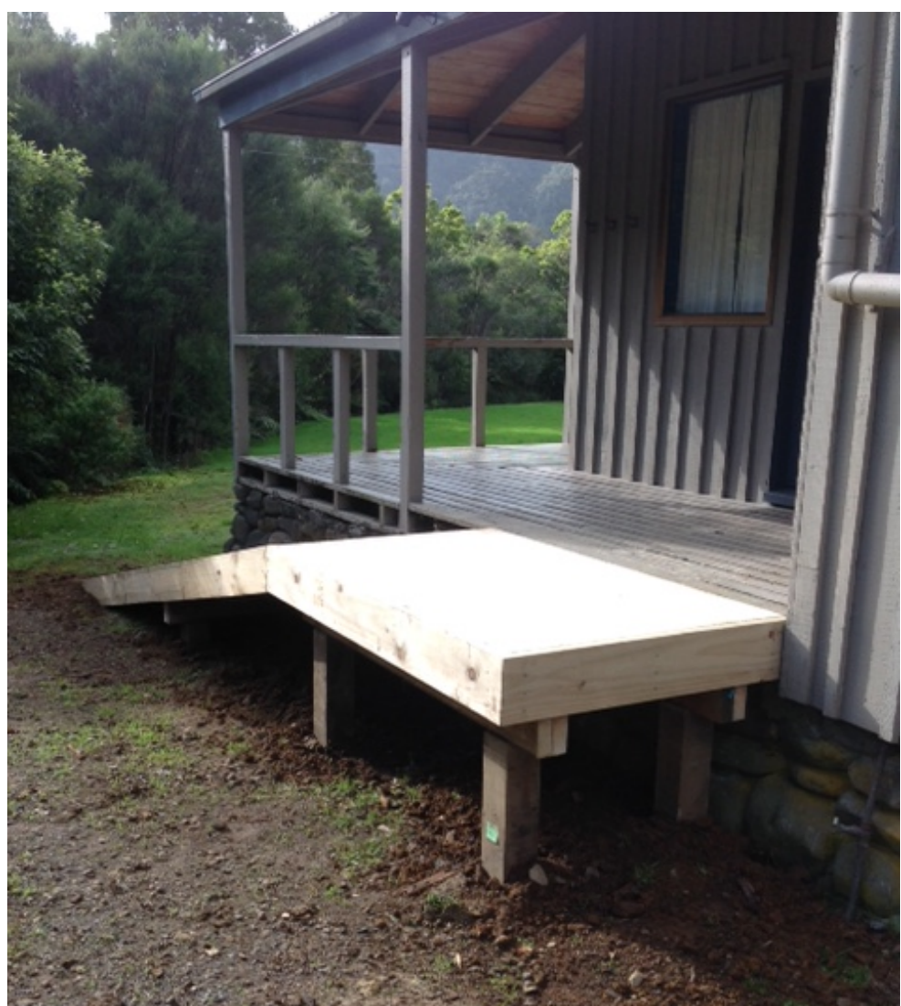
The Boys' Brigade Northern Regional Trust

During 2017, the Lodge continued to provide an activity base for a number of Brigade and other users but became inaccessible for